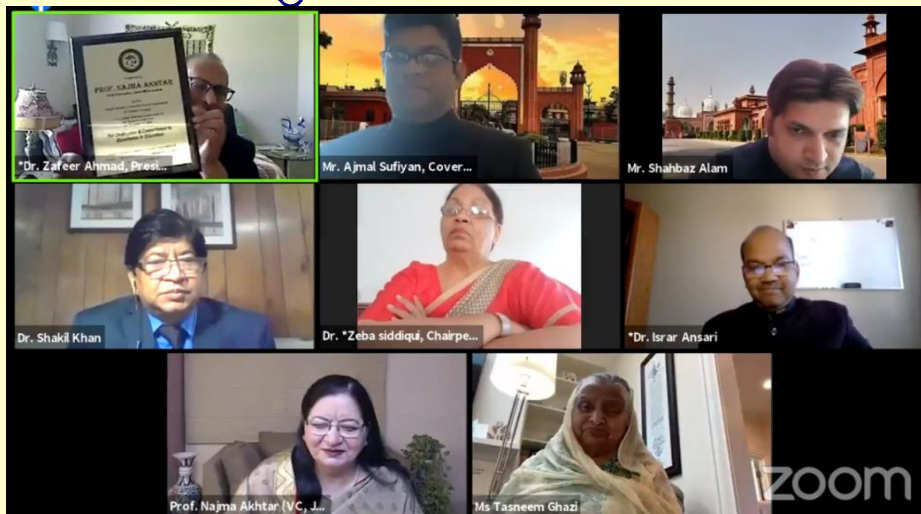
Sir Syed Day 2021 Zoom Call