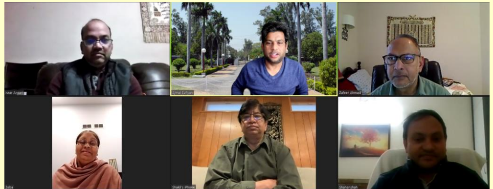
Bylaws committee meeting